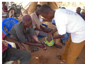
A villager prepares to feed chicken fresh termites.