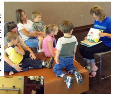
Story time is an excellent way to socialize your infant or toddler and help them develop a lifelong love of reading.