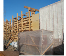
Molds support the construction of the library's new rammed earth walls.

These harsh winter months have not only brought impressive snowfall and made traveling difficult at times, they have hampered construction of the new wing of the library. But, progress is slowly being made on the main east and inside walls. Once these load-bearing are complete, then construction of inner walls and floors can get underway!