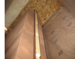
Insulation is sandwiched between the inside and outside walls.